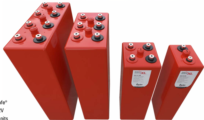
Figure 1: PowerSafe® SBS XL 2V battery units

The PowerSafe® SBS XL 2V battery series takes VRLA batteries into a whole new era. Through the latest innovations in thin plate pure lead (TPPL) technology, these battery units are set to enable customers to attain the design lives they have come to associate with flooded and gel-based batteries, while at the same time getting much higher energy storage densities. As TPPL is a mature field-proven technology in which engineers already trust, it is the ideal chemistry for migration.