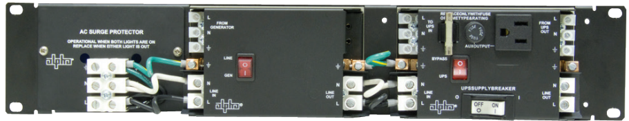
Universal Automatic Transfer Switch (UATS-far right) and Universal Generator Transfer Switch (UGTS-center) shown with surge protection (TVSS-left) in a 19" rack mount bracket (23" rack mount bracket also available). Contact your sales representative for configured part numbers available from the factory